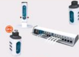
ESS™: EASY SWITCH SOLUTIONS™