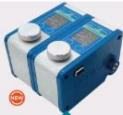
FLOW EZ™: MOST ADVANCED FLOW CONTROLLER