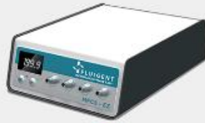
MFC5™-EZ: MICROFLUIDIC FLOW CONTROL SYSTEM