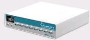
MFC5™-EX: EXTENDED FLOW CONTROL