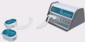
FRP: FLOW-RATE PLATFORM