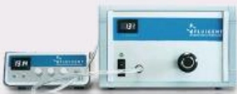
FLUIGENT LOW PRESSURE GENERATOR