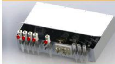
CELL CULTURE CUSTOMIZED INTEGRATED PLATFORM