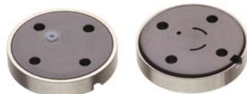
25280 (both sides shown)